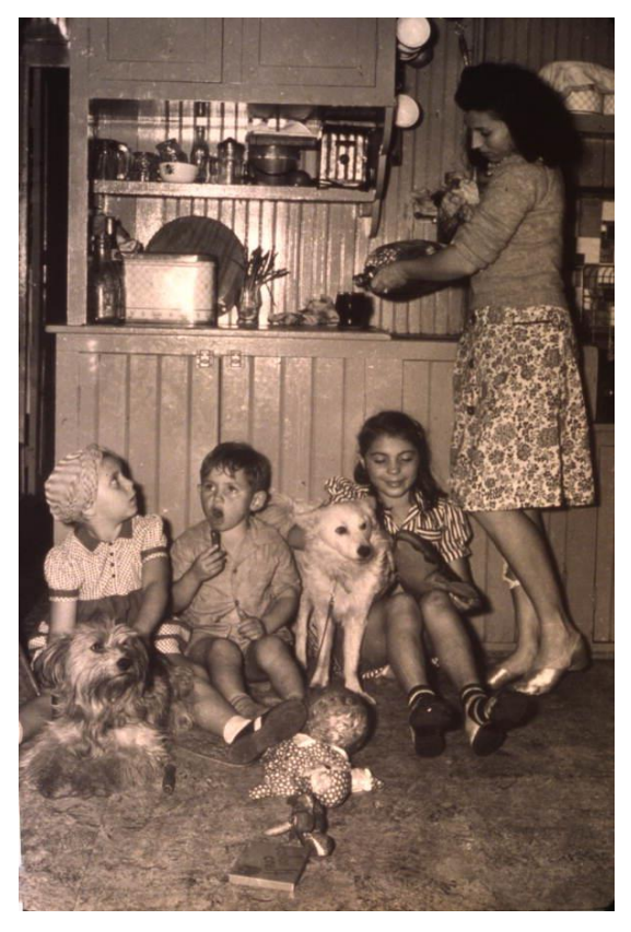
In the kitchen with mother and kids, n.d.