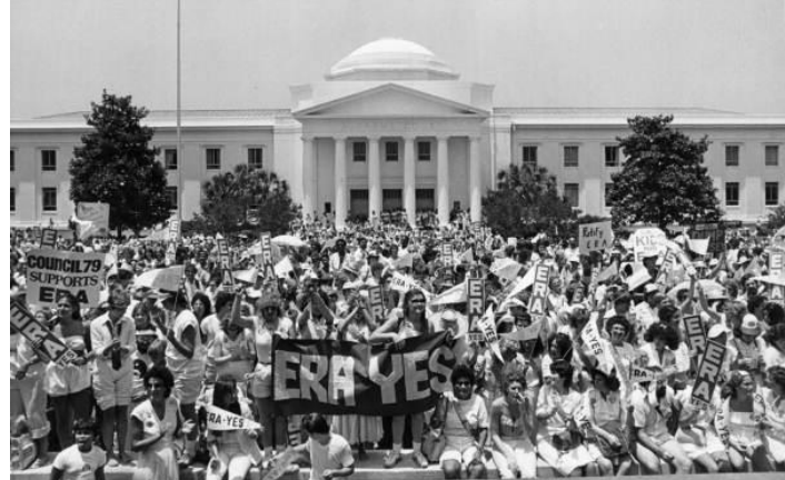
Junior Women's Club of Miami Officers, 1927 Equal Rights Amendment March on Tallahassee, 1982