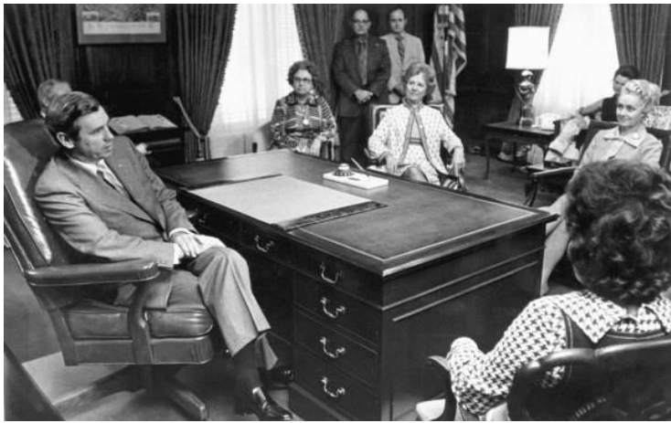
Governor Reubin Askew meets with a delegation of Floridians, 1972

These series originate from the Executive Office of the Governor and include correspondence, meeting, administrative, survey, budget, subject and conference files on women's issues, as well as Women's Hall of Fame nomination files. These series have a variety of creators: governors and their wives, staff members and appointed cohorts. Also included are records that document the work of relevant commissions due to their creation by executive order and administrative position within the Office of the Governor.