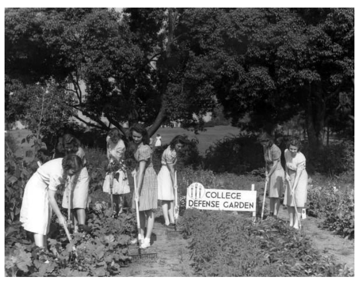
Students tending the Florida State College for Women's College Defense Garden, 1942

This section is organized by the creating agency, then by the agency's record series that relates to women's history and women's issues in Florida. Some agencies have several series listed due to their frequent involvement in projects, initiatives and everyday work relating to women. Several series document women in high levels of management, such as Secretary of State, Secretary of Administration, State Librarian and Archivist, and Chancellor of the Board of Regents. Several series concern education for women in Florida, including several from the Florida State College for Women, predecessor to Florida State University, and other series pertain to equal educational and employment opportunities for women at Florida public universities. Some series document women's rights and health issues such as voting rights, the Equal Rights Amendment, equal employment opportunities for women, family planning and midwifery.